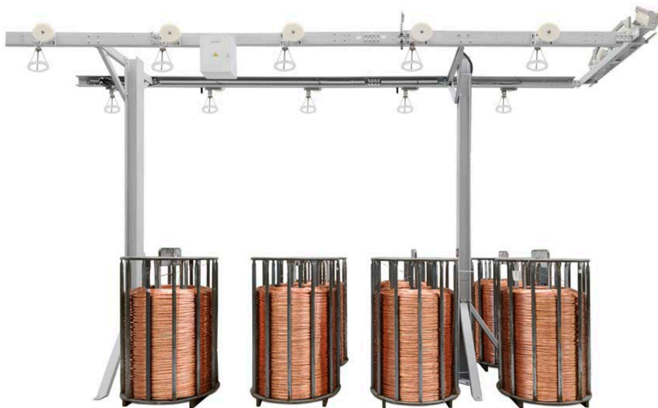
AUF 1001 / 1351 Continuous Barrel Pay-off